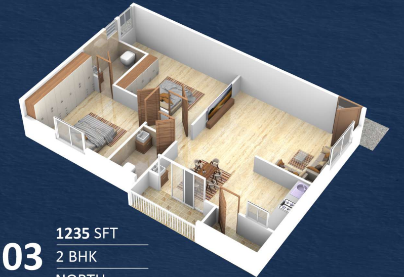
03 1235 SFT 2 BHK NORTH