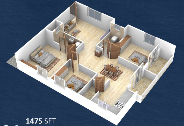
01 1475 SFT 3 BHK WEST