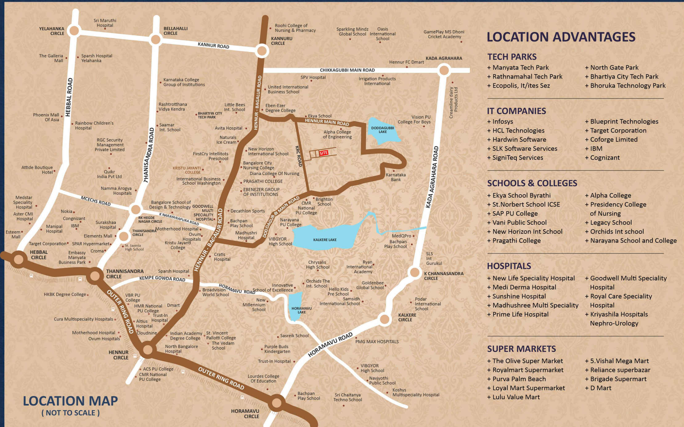
LOCATION MAP ( NOT TO SCALE )