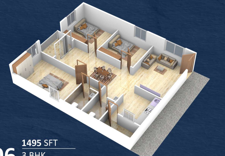
06 1495 SFT 3 BHK EAST